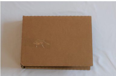
Large Cardboard Spacer (x4)