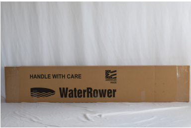
Rail Box (x2)