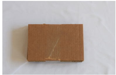
Small Cardboard Spacer (x4)